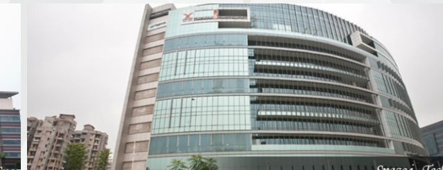
KHALISTA ICONIC TOWER | Sector 84, Gurgaon